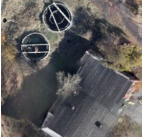
Average blending mode